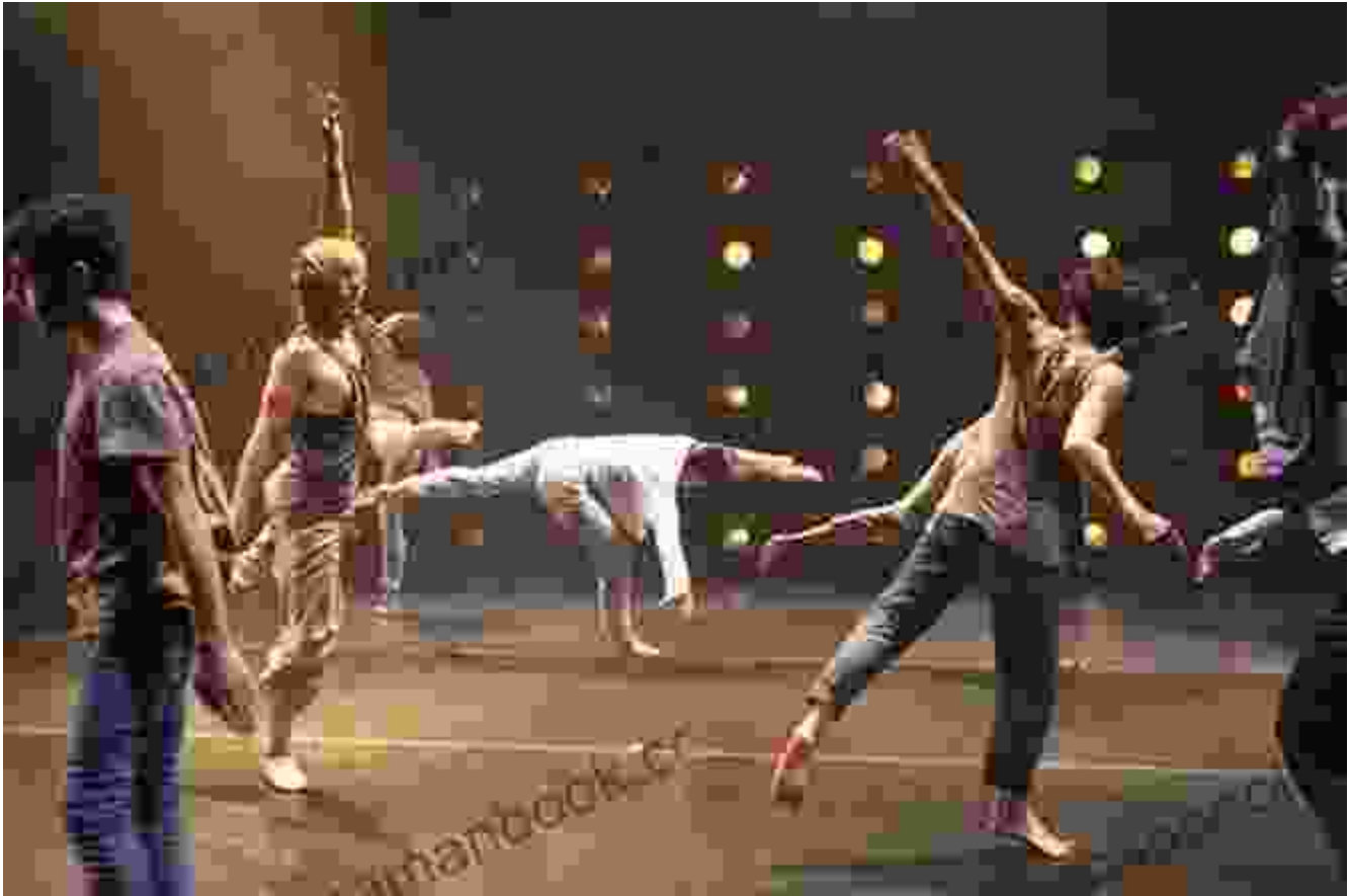
Image Description: A rehearsal scene with actors from diverse backgrounds, demonstrating the transcultural collaborations present in British East Asian plays.