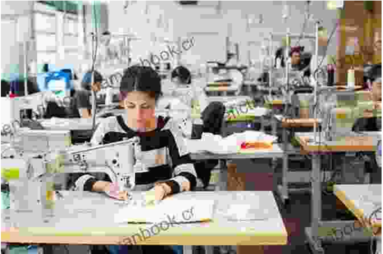
Students working on embroidery projects at The School of Making

Both Alabama Chanin and The School of Making are committed to sustainable practices. Alabama Chanin uses organic cotton and recycled materials in its designs. The School of Making encourages students to use sustainable materials and techniques.